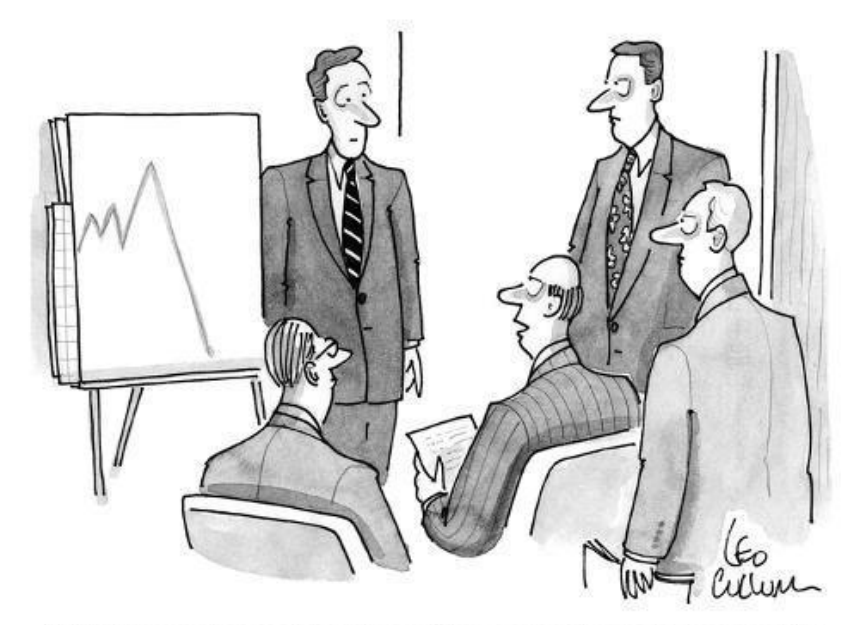
"Would you please elaborate on 'then something bad happened'?"