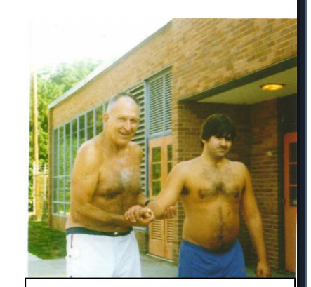
Practicing walking again with my neighbor at West Springfield High (1987)

When my little brother, 11 years younger than me, left for college, I was really depressed. I didn't want to live at home any more, but couldn't figure out how to move. My Mom and Dad helped with the paperwork and I got a Section 8 housing voucher and an apartment. In the beginning I was able to be semi-independent, with only part-time help in the apartment. But then I had a big setback, more brain surgery, and I spent about six months in a nursing home, really the worst place for me to be. My Mom applied for a Medicaid Waiver and when it came through, I was able to get back into an apartment. Medicaid has been life changing. It has paid for staff to live in my apartment with me. I have one man live with me Monday through Friday, then he goes home on the weekends and someone else comes on Saturday and Sunday. They help me make meals, do exercises with me, get out for walks, take me to the grocery store and to visits with my family. I am a volunteer at the Treasure Trove thrift store