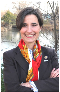
Sen. Jennifer Boysko

to meet and question candidates for the Virginia Senate and House of Delegates